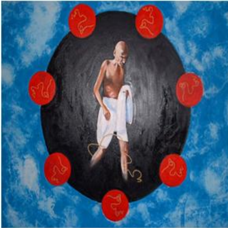
Time for a Walk for Peace